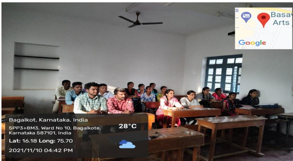
Students of B.Sc.I semester 2021-22