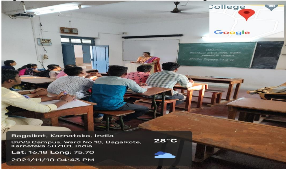
Induction program was conducted to B.Sc. I semester students on 10 th November 2021