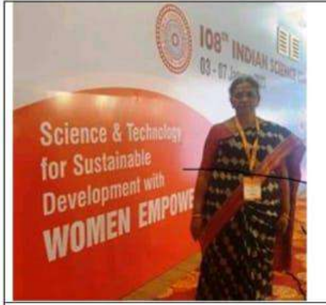
National Science Congress- participated as Women personalities in 2023