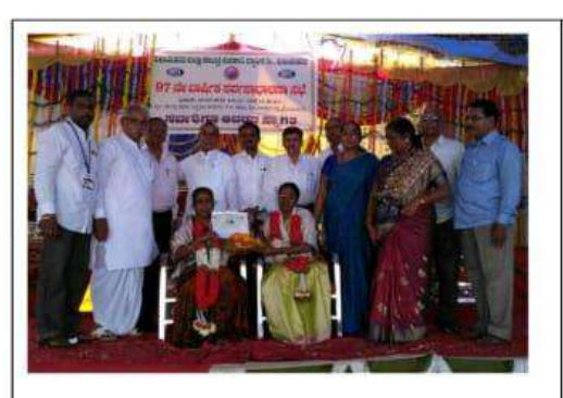
Best Co-operative Urban Bank in Vijayapura District by BDCC, Vijayapura2016