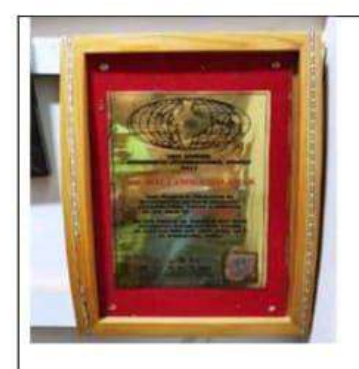
Aryabhata International Award in 2012