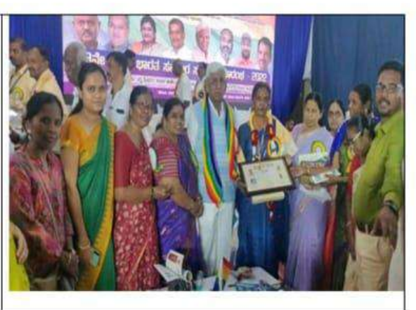
Sahakar Ratna Award 2022 by Govt.of Karnataka