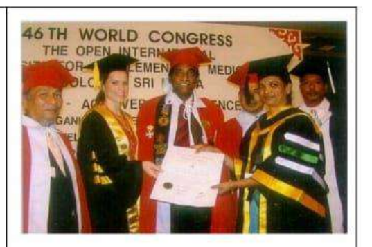
Honorary Doctorate from The open International University for Complimentary Medicines, Colombo Srilankain 2008