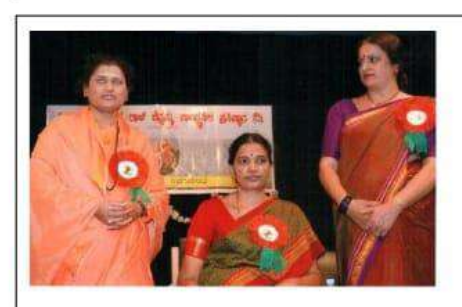
Veeravanite Award Winner in 2006