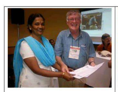
The 7th Mohammed Islam Designs AwardforBest Adopted Traditional Design in Brazil by WFTO 2013