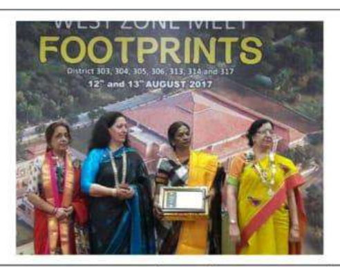
Brave Heart National Award by Association of Inner Wheel Clubs India 2017