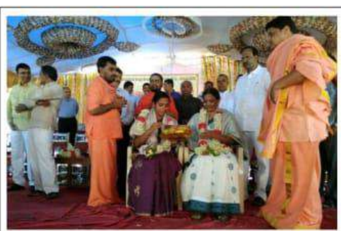
Best Co-operative Urban Bank in Vijayapura District by BDCC, Vijayapura2017