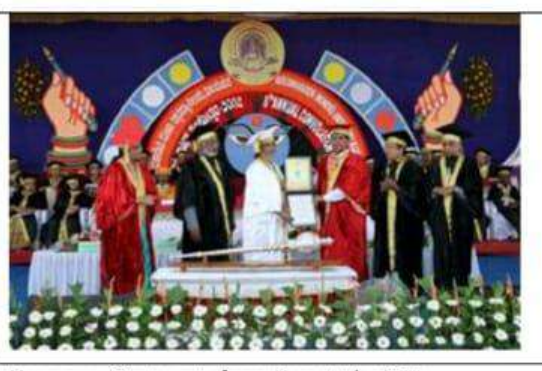
Honorary Doctorate from Karnataka State Akkamahadevi Women's University, Vijayapur 2017